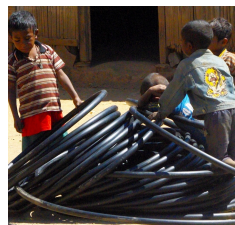
$2 per metre Poly Pipe

A small amount can make a huge difference to the lives of many